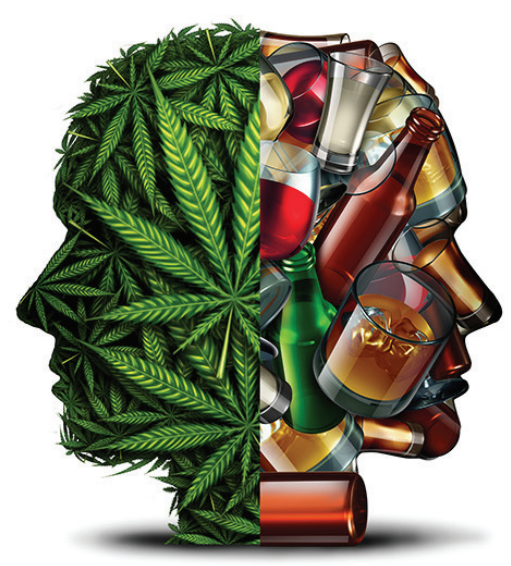
Teens using nicotine more likely to start using alcohol and drugs.

Youth under 18 who smoke show early signs of heart disease and are at a greater risk of having a stroke. Youth who smoke tend not to be as physically fit (both in performance and endurance), have a faster heart rate, are more easily short of breath, and are at an increased risk of lung cancer. Youth who smoke are also more likely to have seen a doctor or other health professional for an emotional or psychological complaint.