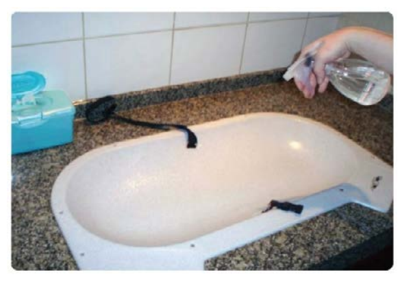
5. Clean & disinfect the change surface

If there is visible contamination, first clean the surface with hot water and soap.