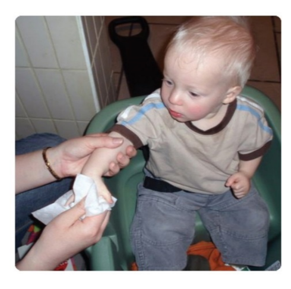
4. Dress child, wash and dry hands with paper towel

If applying ointment, use a single use applicator for ointments or creams.