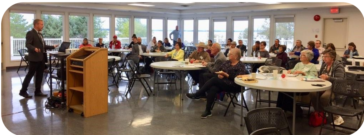
Enhancing Care in the Community information session

Through recent recruitment we're excited to hear more from the communities of Bonnyville, Cold Lake, Redwater and St. Brides. We seek representation from Athabasca, Boyle, Smoky Lake and Thorhild to help represent our large geographic region. See page six for the link to apply.